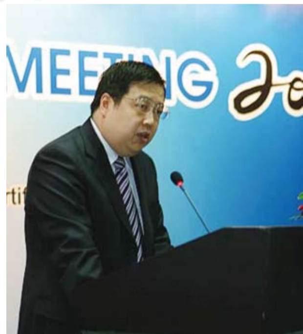
May 12 th -15 th , 2009 the 46th Committee of Testing Laboratories (CTL) Meeting was held in Beijing. The Committee of Testing

Laboratories is the technical forum of the IECEE and through the technical experts' working groups to resolve the technical problems of the CB scheme, to achieve reproducibility and consistency of test results and to promote a close collaboration between testing laboratories.